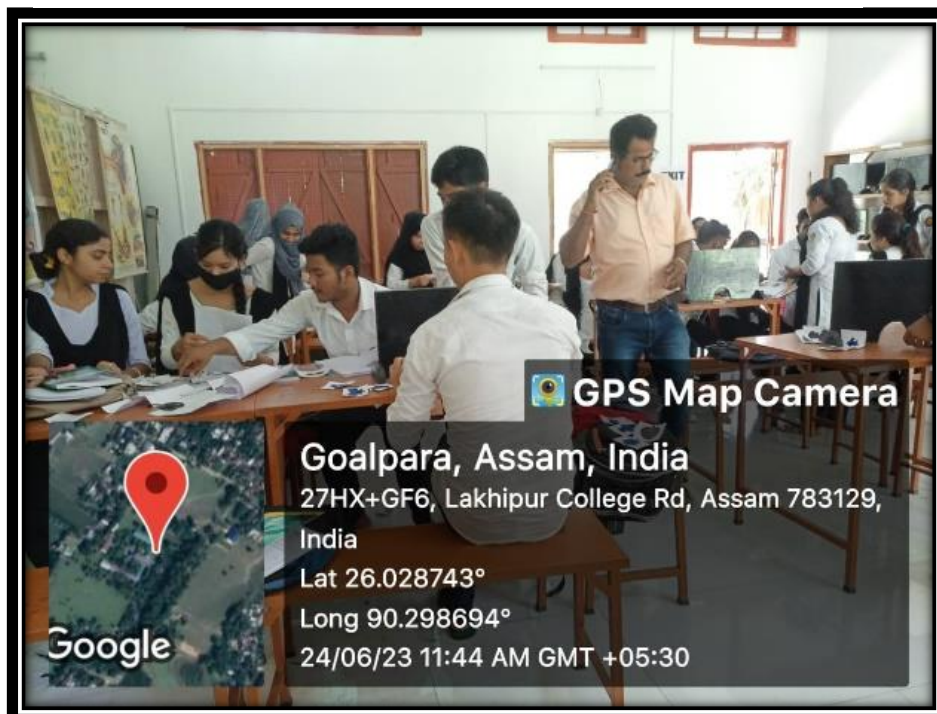
Students are busy with doing psychological practical in the practical laboratory