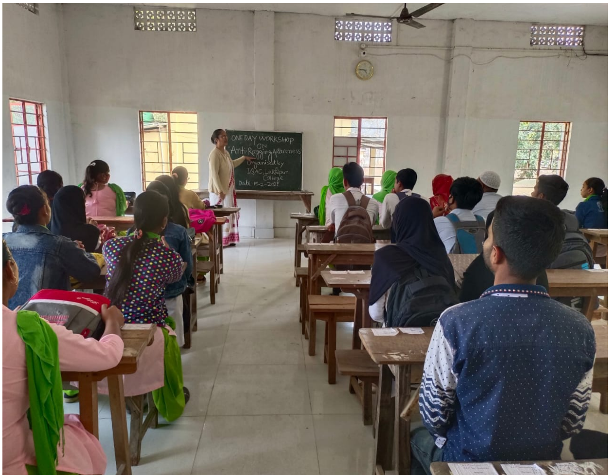
One Day Workshop on Anti-Ragging

In accordance with the directives from UGC, Anti-ragging Cell, Lakhipur College displayed posters and anti-ragging slogans in college campus and organized anti-ragging awareness programme on 20 th August, 2021, 8 th August, 2022 and 12 th August, 2023 in order to make students aware of the seriousness of ragging as a crime. The principal of the college informed to the students about the prohibition ragging Act 1998. He also pointed out that ragging is completely prohibited at the college and strict action will be taken against the students who indulge in such activities. Students and faculties were enthusiastically participated in these programmes. The aim of the cell is to create awareness among the students against ragging. The Cell did not find any case on ragging during these sessions.