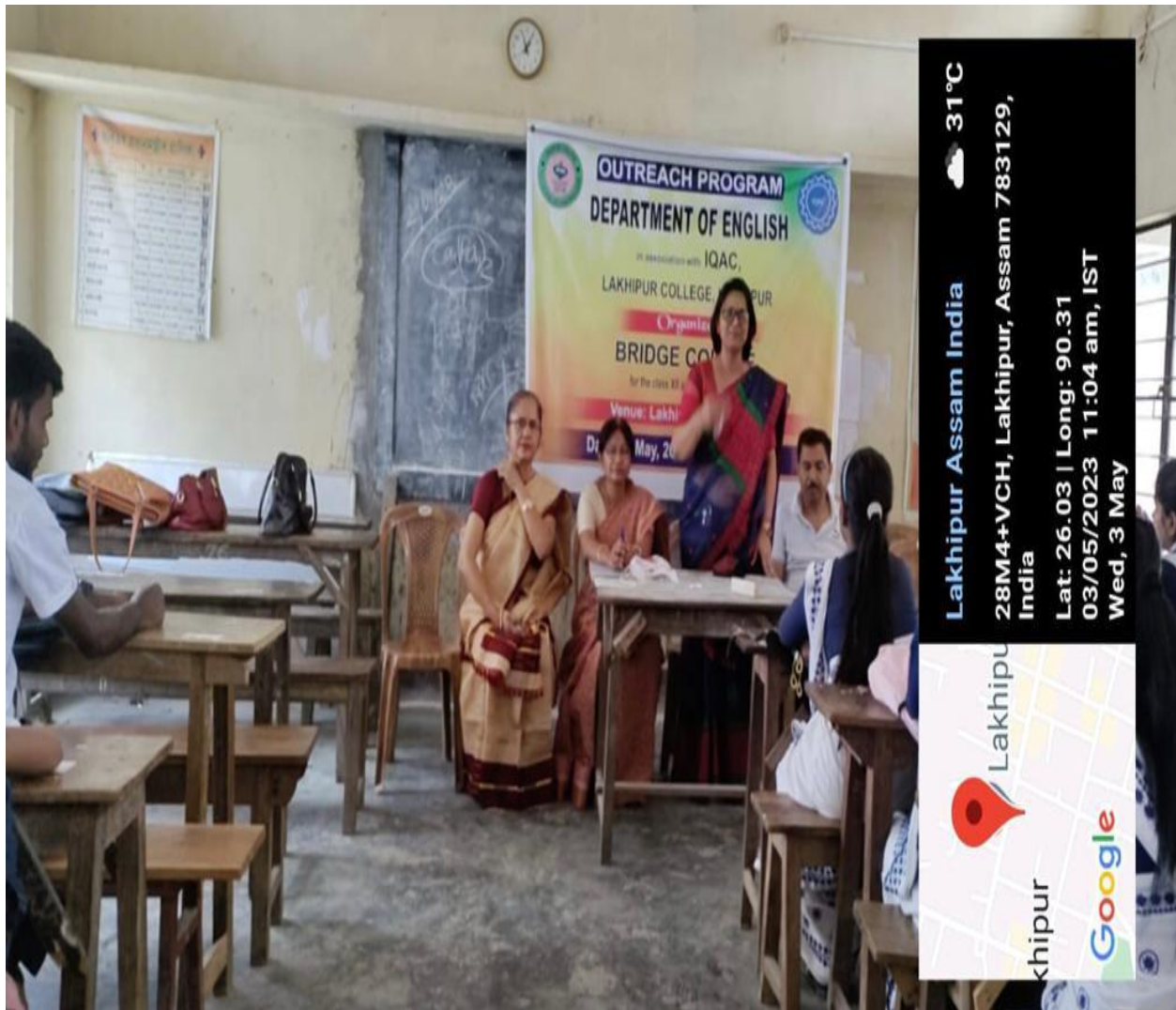
Bridge Course at Lakhipur Higher Secondary School in association with the Department of English, Lakhipur College from 03/5/2023 to 12/5/2023