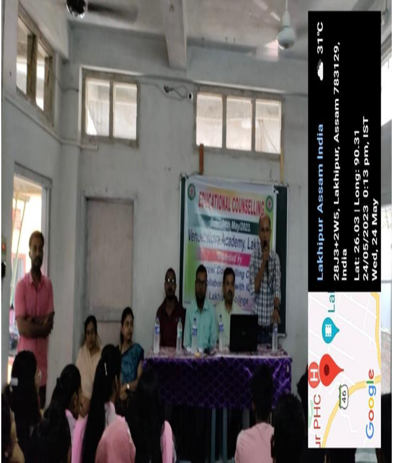
Educational Counselling at Nova Academy. On the theme “Lakhipur College, the only seat for of Higher Learning for Arts Students in Lakhipur area”