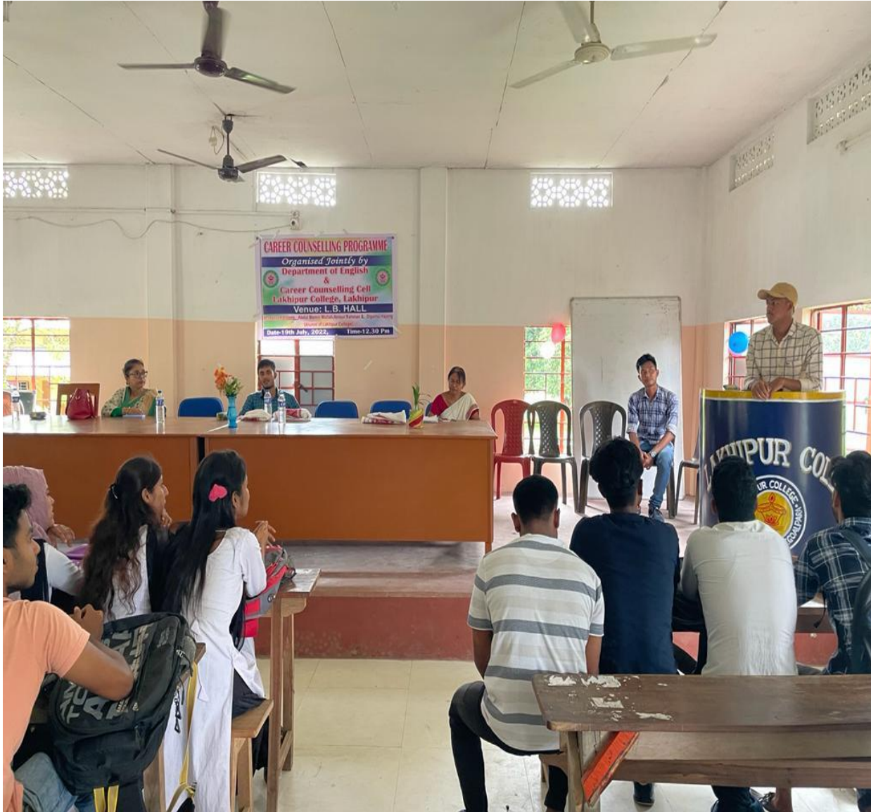
Experience Sharing programme by Alumni Organised jointly by English Department and Career Counselling Cell